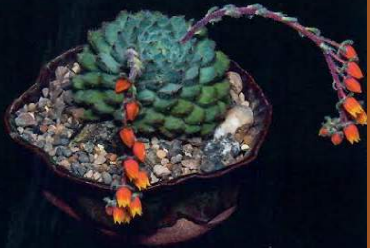
Echeveria setosa 'deminuta'