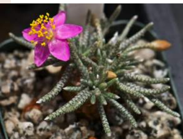
Avonia alstonii ssp. quinaris