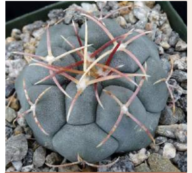
Dyckia 'Yellow Glow'

Thelocactus are found from Southern Texas through central Mexico, mostly in the Chihuahuan Desert, but extending into brushland and thorn scrub in the western parts of its range, and into the Rio Grande Plains region in Texas. Thelocactus bicolor has the largest range, extending from central Chihuahua in the west into Texas in the north, and as far south as San Luis Potosi. The plants are generally small with prominent spines. They are notable for having big, showy flowers that range in color from white to pink to yellow.