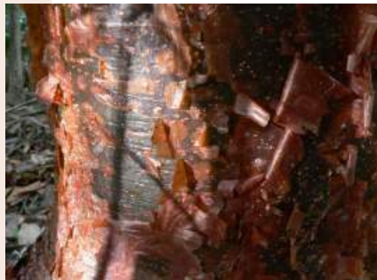
Peeling bark of Bursera simaruba

with red or brown peeling bark, rarely seen in cultivation. Some of the tree-like species are very vigorous growers, going from a foot to 6 feet or more in a just two years, in a medium size pot. Most Bursera are aromatic, with wonderful woody fragrance from their leaves and bark. Most of the species are worth growing and can be made into show specimens by suitable pruning. Many of the larger species require hard pruning every year to avoid having them turn into trees. Species frequently seen are Bursera fagaroides (shown above), Bursera microphylla , with very small leaves, Bursera multijuglans (with red peeling bark), and Bursera simplex . There are many other species from Central and Southern Mexico, and Central America that should be grown and shown.