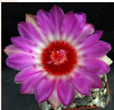
Dyckia 'Yellow Glow'

Thelocactus are easily grown, tolerant of heat and moisture, but not cold and moisture. They benefit from protection from being cold and wet, although plants left unprotected during the last several winters survived in good shape. Some species develop fairly large tap roots, and should be planted in deep enough pots to give them room to grow. They are easily propagated from seed, and this is the best way to develop a good collection from different populations. They can also be propagated from offsets, with a cutting allowed to dry, and then replanted.