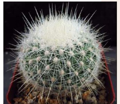
Dyckia 'Yellow Glow'