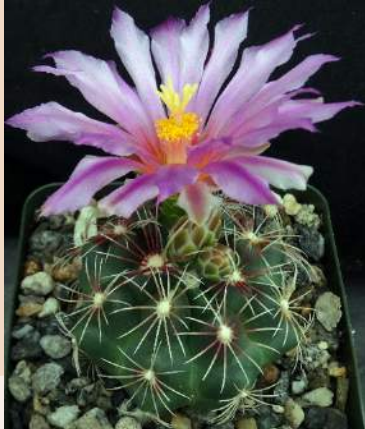
Dyckia 'Yellow Glow'