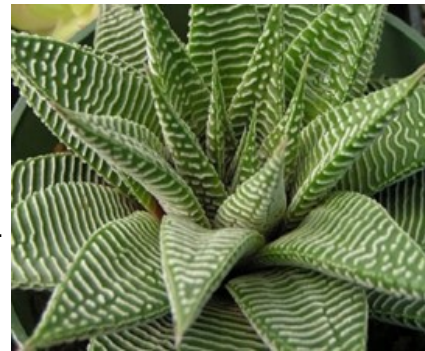
Haworthia limifolia var. striata

Haworthia like bright light and morning sun, which brings out the color of their leaves. If the light is too dim, the leaves will be a pale green and the leaves will stretch. On the other hand, too much sun in the summer can burn the leaves. Well grown plants form a firm, tightly packed rosette, showing the best color possible. Many species will exhibit reds, greens, whites and browns when grown properly. Haworthia are fairly free from most insect infestations, although scale and mealybugs can sometimes attack a plant. Slugs and snails are fond of them as well.