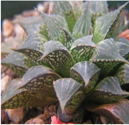
This variegated Haworthia sold on Ebay for over $1,600

Haworthia are among the most commonly grown succulent plants. There are about 60 species, but the number of varieties, cultivars and hybrids are overwhelming and continually increasing. Haworthia , are very closely related to Aloe and Gasteria . Haworthia are endemic (i.e. native exclusively) to South Africa, and most inhabit a Mediterranean environment not too different from Southern California. The plants are primarily winter growers, though growth can occur from early autumn through early summer.