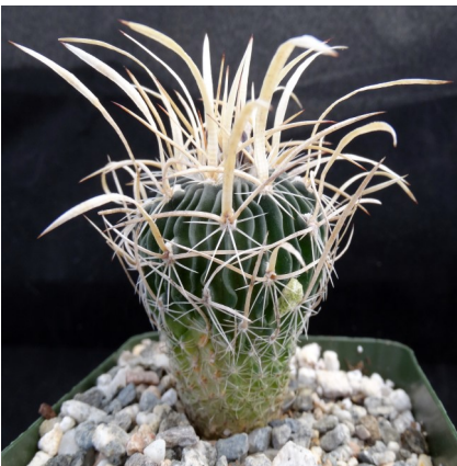
Stenocactus sp. 'Palmillas'

Stenocactus grow in grass lands, and need some protection from full sun. They are easy to grow, putting on most of their body weight each year in the early spring to summer. Plants growing outdoors will grow slowly during the winter using just the water from winter rains. It is important not to fertilize during the darker days of December, January or February, or etiolation or stretching of the body will occur. The narrow ribs, the wooly areoles, and the dense spines are an ideal habitat for mealy bugs. Frequent inspection of the plants will prevent them from spreading. Older plants sometimes get corky near the base. Keeping the plant in continuous growth delays this, but in some species the cork is inevitable.