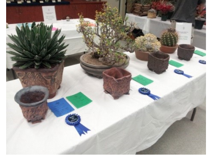
Best in Class Show Plant Winners