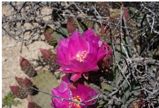
Opuntia erinacea var.

erinacea Opuntia chlorotica Echinocactus polycephalus Echinocereus triglochidiatus Echinocereus engelmannii var. chrtysocentrus (lt. pink) Yucca baccata ( Banana Yucca) Yucca brevifolia