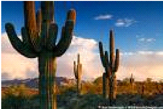
Carnegiea gigantea forest

One of the more remarkable instances of endemic monotypic cacti is in the Sonoran desert where Carnegiea gigantea forests (Saguaro) are found. Originating in the dry climate condition of the Sonoran Desert, these specimen dominate the landscape.