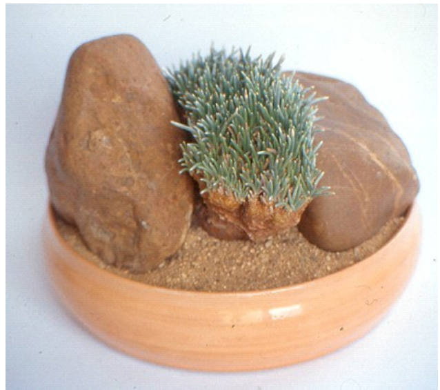
Avonia quinaria ssp. als

The genus Avonia originates in South African in Great Namaqualand and Bushmanland. Avonia form a woody caudex, approximately one inch high, which expands as the plant matures. Leaves emerge from the top of the caudex. This plant typically requires partial shade in cultivation and can be sensitive to frost or colder conditions. Although listed as a deciduous plant, many specimen retain their leaves all year long. Flowers are carmine red, white, or pink. Avonia flowers are self-fertilizing and can generate seed if you have only one plant.