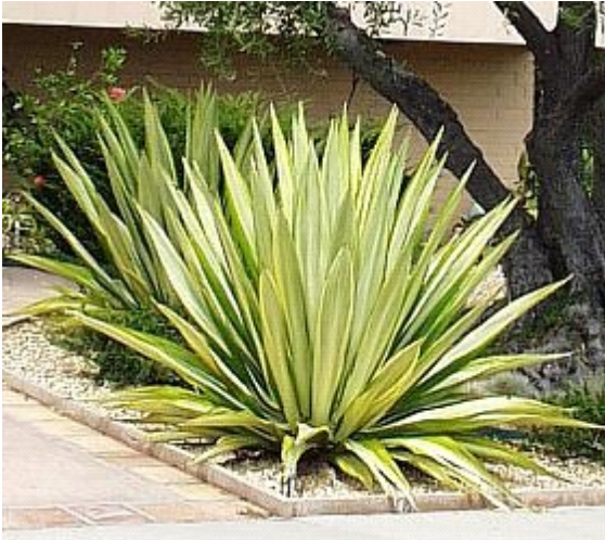
Furcraea foetida 'Mediopicta'