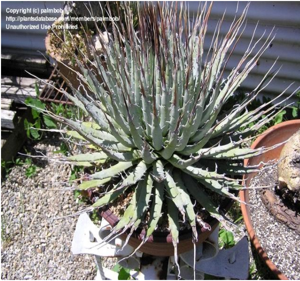
Agave utahensis v. nevadensis

The Yucca genus contains approximately 40 species. The stiff leaves of the plant form large rosette which ultimately branch. Yucca plants typically produce woody trunks and many species branch and become tree-like. Flowers are white or cream and are organized on panicles (a cluster of flowers on a branch structure).