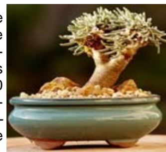
Avonia alstonii ssp. quinaria

While there are quite a number of miniature cacti, the number of miniature (non-cactus) succulents is even bigger. One of the best places to look for miniatures is among the mesembs. Some species of Conophytum are the very definition of miniature, in that some species such as C. pellucidum are so small that you could have upwards of 100 heads in a three inch pot! Many species of Lithops work well too. Also consider some of the mesembs that aren't living stones types such as Titanopsis or Aloinopsis species. Outside mesembs, consider some of the smallest Crassula , Haworthia , Sedum , or Avonia . These are just suggestions, but if you have a plant that looks good and proportional in a 4" inch or smaller pot then you have a miniature!