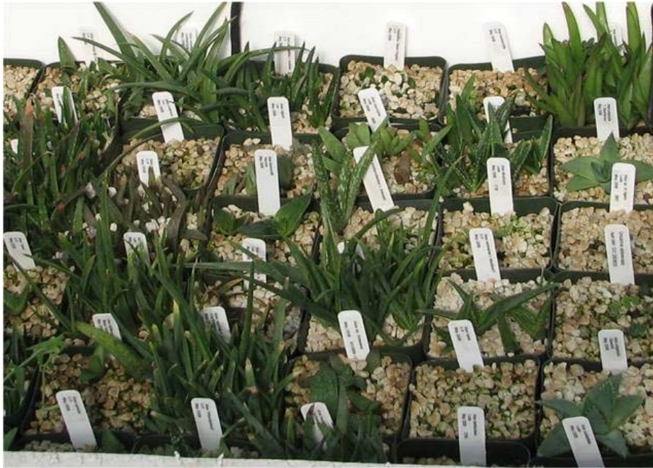
Cactus Seedlings Grown at C&J Nursery in Vista