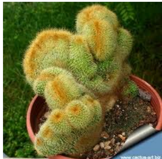
Notocactus leninghausii crest

through the fall, and going more or less dormant in the during the colder months. Some species will flower in mid winter, and given their native environment, most do better given a little water year around. If watering Notocactus in the winter, avoid fertilization or weak growth may result. Some of the more tropical species need protection from colder weather to prevent scarring, but most will take normal Southern California winters without protection.