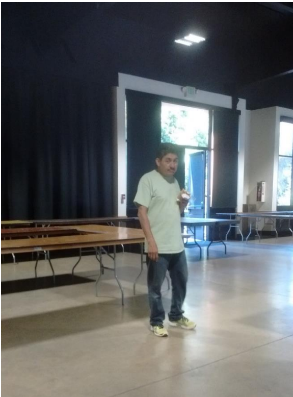
A few snapshots from set-up day.