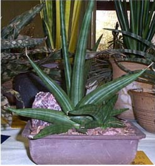
Sansevieria patens by Karen Ostler photo T. Nomer

There are about 60 species of Sansevieria , but since many of the species are variable and have widespread habitats, there are more names than this. There are also dozens of cultivars, particularly of variegated Sansevieria . They are currently in the Dracenaceae family, but have moved through the 'dumping ground' families. In older references, they will be found in the Lilaceae , Aloinaceae , Agavaceae , and other families. Most Sansevieria are native to Africa, although some come from India, Asia and the South Sea Islands.