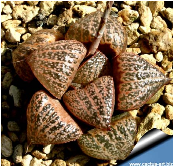
Haworthia magnifica v. splendens

Haworthia magnifica v. splendens like the previous species found in South Africa. This plant grows even to the ground and its coloration helps to camouflage it from damage from insects and other potential predators.