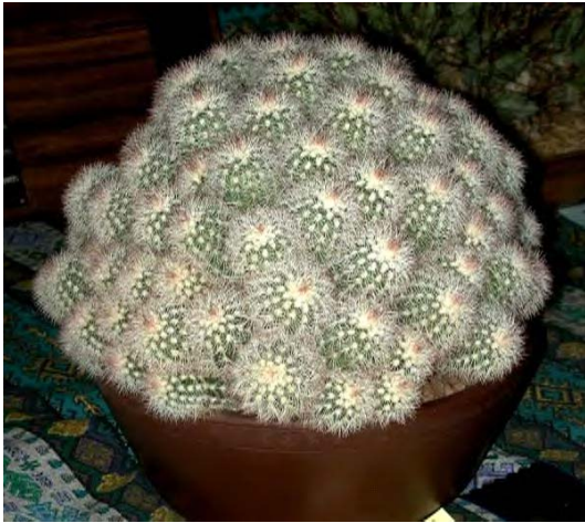
Vince Basta's Echinocereus baileyi shown in the 15 th InterCity Show

Echinocereus species can be found throughout the Western United States, and the range of species stretches through the American west and through Northern and Central Mexico to about Mexico City. As might be expected from a genus covering such a large range, Echinocereus are extremely varied in form, ranging from nearly spineless green balls such as E. knippelianus , to very spiny short columnar species such as E. engelmannii , to pencil thin sticks such a E. poselgeri .