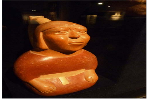
Chicalayo Saipan Museum Figure