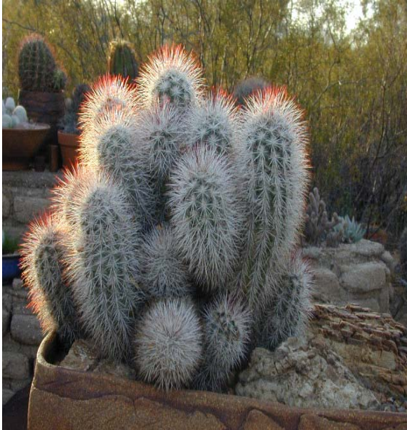
Echinocereus viridiflorus v. canus

specimen and develops greenish flowers during the spring season. This plant originates from the Trans-Pecos area of Texas.