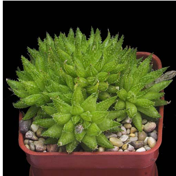
Haworthia reticulata v. reticulata

Also found in South Africa, is Haworthia reticulata , a species which has a number of subspecies associated with it. Haworthia reticulata is a liberally clustering plant that will turn reddish-bronze color in bright light.