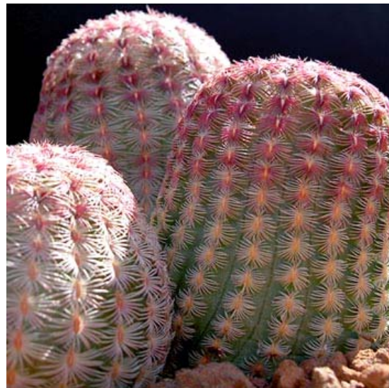
Echinocereus pectinatus v. rubispinus

A very popular species of Echinocereus , often found in the shows, is pectinatus v. rubispinus . This plants produces a vibrant rose-colored flower during the spring and its spines retain a reddish tinge throughout the year.