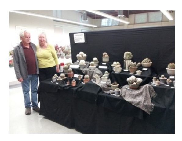
Third Place - Tie