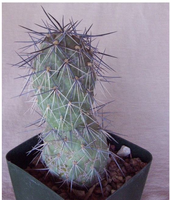
Tephrocactus alexanderi v. alexanderi

The Cactus family is divided into a of subfamilies. The number Opuntioideae is one of these sub families. The Opuntioideae covers the largest geographical range of any of the sub-families, stretching from Southern Argentina to Canada, and covers all of the Caribbean islands and Pacific Islands from the Galapagos to the Catalinas. It is naturalized on every continent except Antarctica. It is a pest and a noxious weed in many places, and is displacing native vegetation in parts of Africa, Madagascar and Australia.