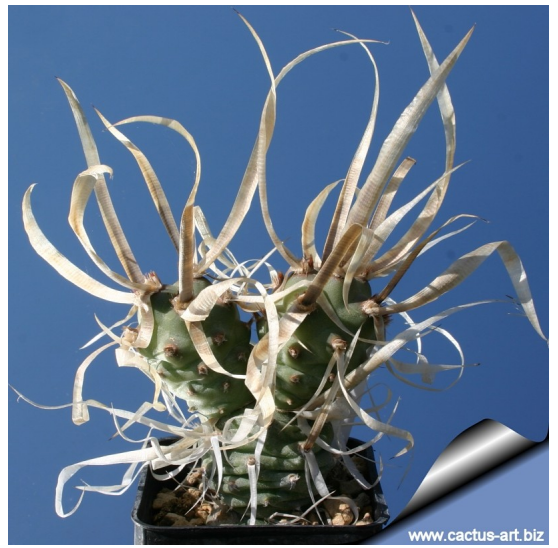
Tephrocactus articulatus v. papyracanthus

All cuttings root easily. Seed propagation requires patience, with seed scarification and sometimes artificial wintering Propagation of all Tephrocactus is most easily accomplished by cuttings or from the joints that comprise the plant by keeping the seed damp and cold in the refrigerator required. Seed germination can be erratic, with seeds from the same plant sometimes germinating in days, and sometimes not for months.