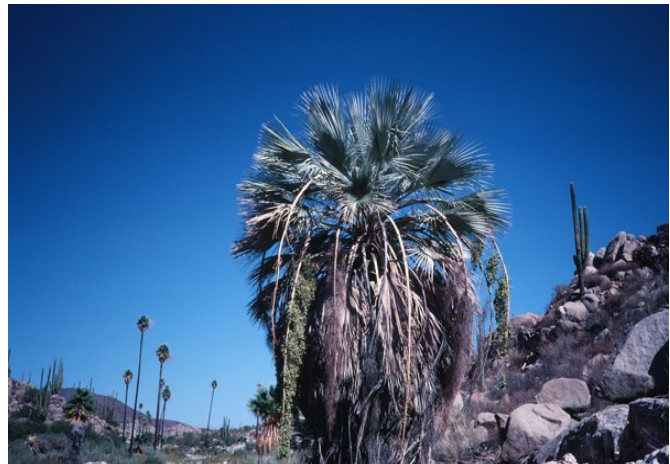
Baja: Mexican Blue Fan Palms ( Brahea armata ) tower above the boulders of Catavina