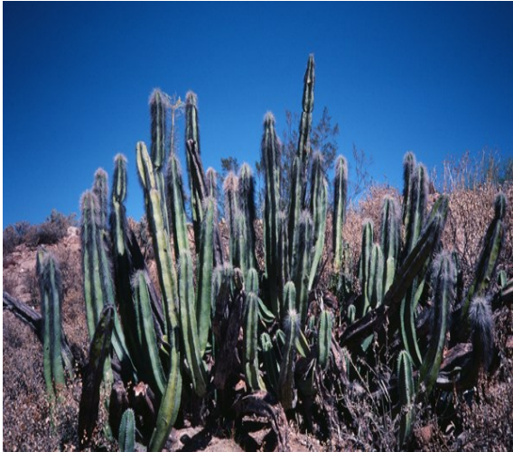
Baja: Non-monstrose form of Lophocereus schottii

In the second half of this article, we stroll the grounds of "Casa de Wegner."