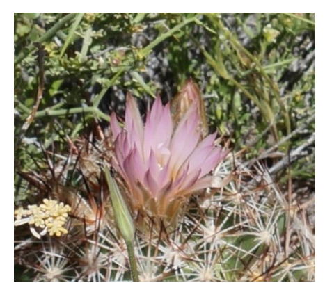
Cylindropuntia bigelovii Cylindropuntia echinocarpa Euphorbia albomarginata Opuntia basilaris var. brachyclada Opuntia ramosissima Opuntia echinocarpa var. echinocarpa