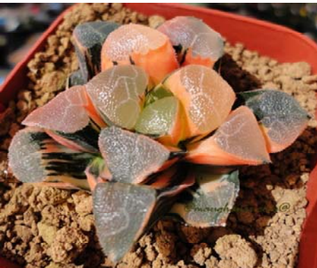
This variegated Haworthia recently sold on Ebay for over $1,600!

Plants are most easily propagated from offsets. Seed is sometimes available, and easily germinates in cool weather, with best results coming in October through January. The trick with Haworthia seed is to get enough growth on the seedlings to allow them to survive their first summer dormancy. Most seedling losses are due to heat and dry weather rather than over watering. Fresh seed is needed as most Haworthia seed lose their viability after a year or so.