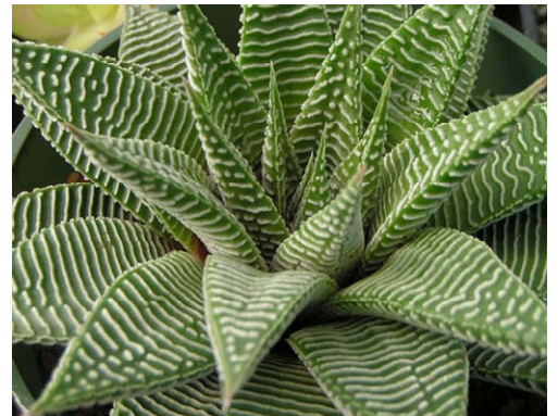
Haworthia limifolia var. striata

Haworthia like bright light and morning sun, which brings out the color of their leaves. If the light is too dim, the leaves will be a pale green and will stretch. On the other hand, too much sun in the summer can burn the leaves. Well grown plants form a firm, tightly packed rosette, showing the best color possible. Many species will exhibit reds, greens, whites and browns when grown properly. Haworthia are fairly free from most insect infestations, although scale and mealybugs can sometimes attack a plant. Slugs and snails are fond of them as well.