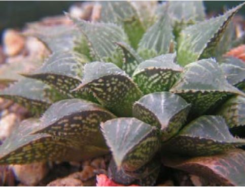
Haworthia mirabilis var. paradoxa

Haworthia are among the most commonly grown succulent plants. There are about 60 species, but the number of varieties, cultivars and hybrids are overwhelming and continually increasing. Haworthia , are very closely related to Aloe and Gasteria . Haworthia are endemic (i.e. native exclusively) to South Africa, and most inhabit a Mediterranean environment not too different from Southern California. The plants are primarily winter growers, though growth can occur from early autumn through early summer.