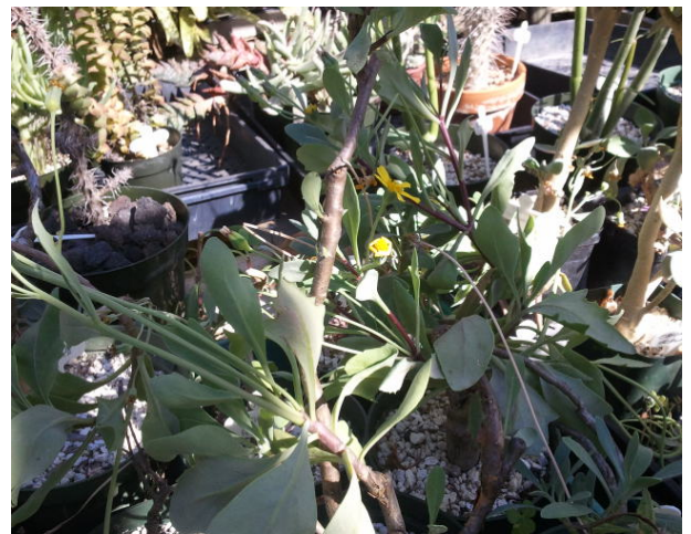
Rogers & Darlene Weld