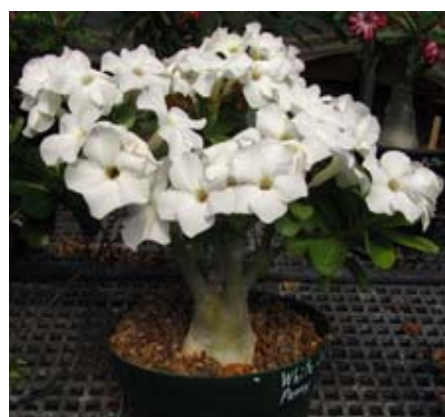
Adenium white jade peony