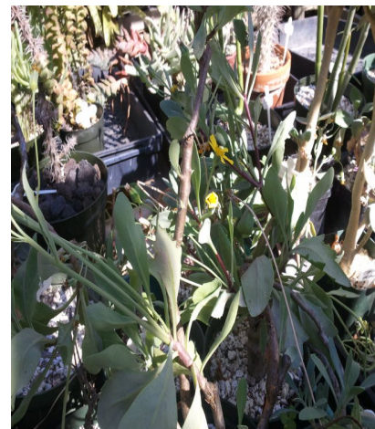
Rogers & Darlene Weld