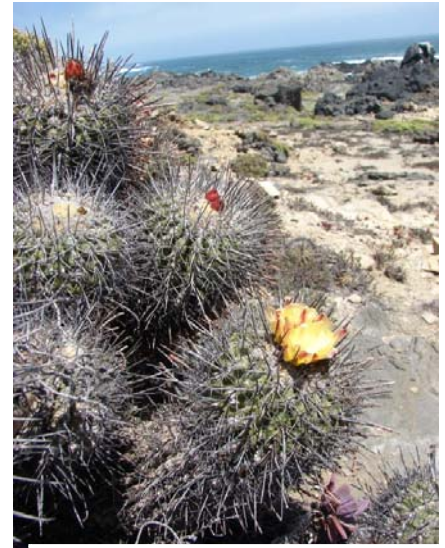
Copiapoa coquimana in habitat

The habitat of Copiapoa is incredibly dry, even by desert standards. They occur in the Atacama, the world's driest desert. The average rainfall in the region is 1mm/year (0.04 inches). Many areas get rainfall only once every four years and some weather stations have never recorded a single drop of rain! Interestingly, Copiapoa thrives in these extreme conditions to the extent that the genus peters out at the northern and southern ends of its range because these areas are where rainfall starts to become more regular and predictable.